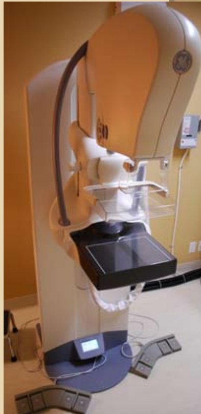
One of the two full-field digital mammography units at the Major's Path site.

We are very grateful to CIBC and the Canadian Breast Cancer Foundation-Atlantic Region for supporting this advanced technology to benefit the women of our province.