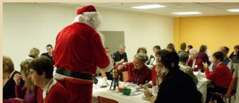
Santa giving out goodies to staff at the Dr. Leonard A. Miller Centre.

For several days in December, Santa's elves are busy serving up delicious hot breakfasts to Eastern Health staff. Breakfast with Santa is an annual Christmas tradition at the five adult hospitals the Health Care Foundation serves, and every year Foundation staff and members of the Board, along with senior management of Eastern Health, visit the sites and serve breakfast, prepared and graciously donated by Morrison-Health Care Food Services. Of course, the highlight of the breakfast is a visit from the jolly old elf himself! All proceeds from Breakfast with Santa are in support of the Health Care Foundation. Our thanks to Morrison-Health Care Food Services, the planning committee, our volunteers and Eastern Health management and staff.