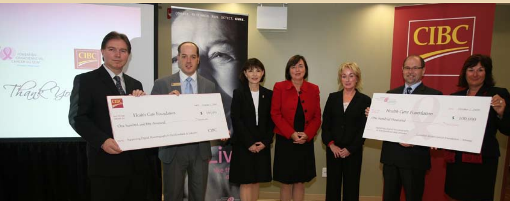
CIBC and the Canadian Breast Cancer Foundation-Atlantic Region cheque presentations to the Health Care Foundation, toward the purchase of a digital mammography unit.