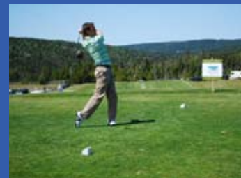
'Beat the Pro' with Brad Gushue.