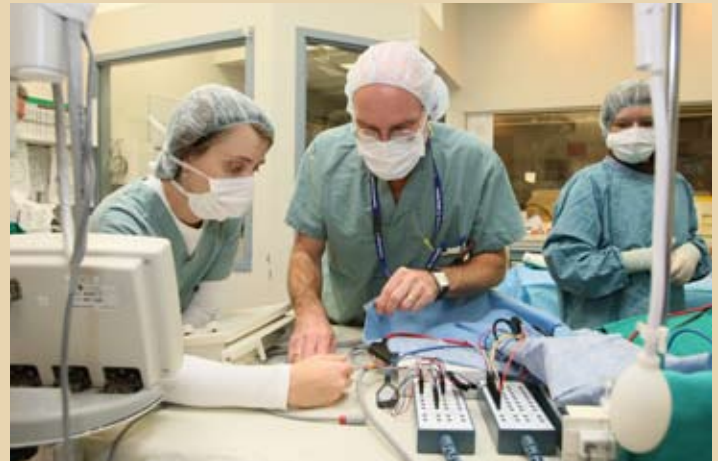
An electrophysiology procedure in the cardiac catheterization lab.