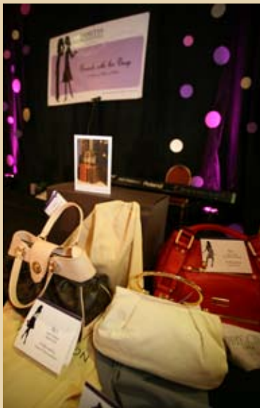
Brunch with the Bags™ Live Auction Items.

Brunch with the Bags™ is proudly presented by Fortis Properties.