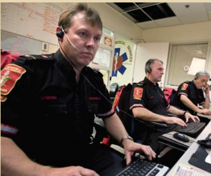
The CAD system will provide a faster response by identifying the closest ambulance and providing the mapping and routing information.