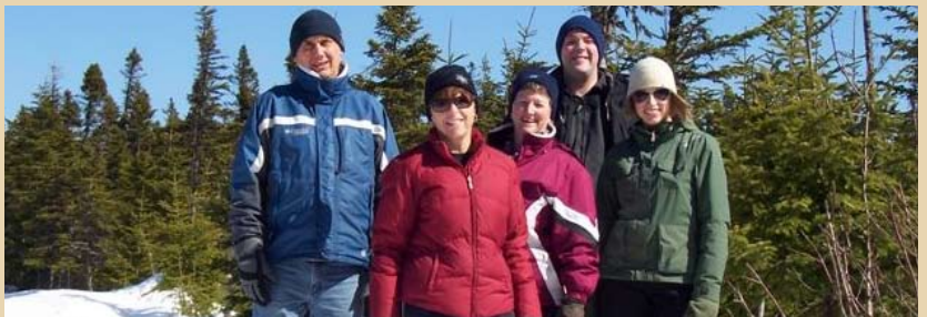
Snowshoeing at Octagon Pond, 2010.