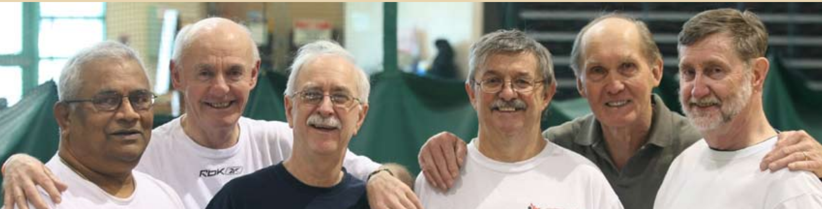
Clients of the Cardiac Rehabilitation Program.