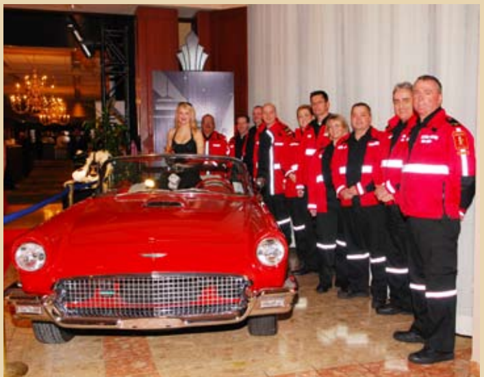
Members of the Eastern Health Paramedicine and Medical Transport team at the 2009 Eleganza Gala.