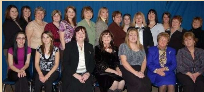
Members of the IODE Shore of Nine Points.

The IODE Shore of Nine Points is a busy group. From sponsoring needy families at Christmas, to purchasing hygiene kits for the Street Outreach Program, to adopting a classroom in Northern Labrador, this group embodies its slogan, 'Women dedicated to a better Canada.' Earlier this year, the Chapter donated funds to the Health Care Foundation's Comfort in Care program, toward the purchase of a sleeper chair. Hospital sleeper chairs can be comforting for the friends and families of patients who want to remain with their loved ones through the night. The Health Care Foundation is most grateful to the membership for their generosity and continued commitment to adult health care.