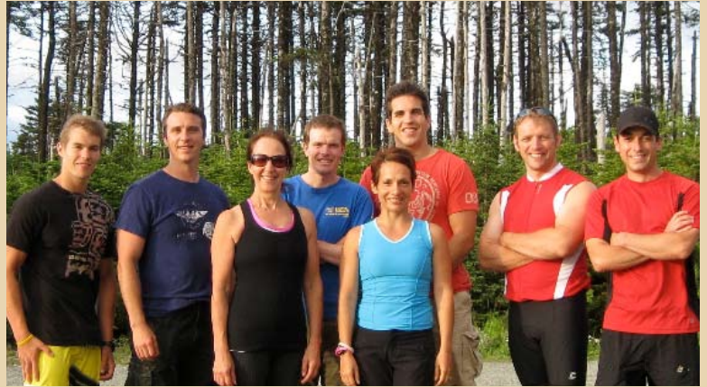
2009 Team Mental Health NL.