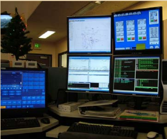
The new Computer Assisted Dispatch system is similar to the system in this photo.

The sophisticated technology of the Computer Assisted Dispatch system will be of tremendous benefit to the residents of Newfoundland and Labrador.