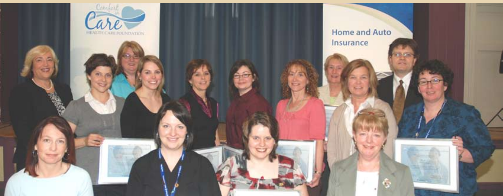
Spring 2009 Comfort in Care Grant Ceremony.